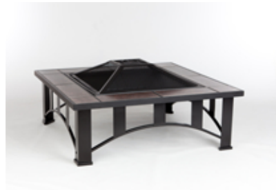
Assembled Fire Pit