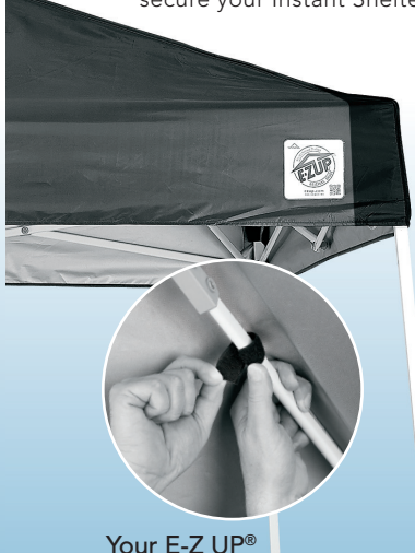
Your E-Z UP® shelter setup is now complete!

Note: It is recommended that you use genuine E-Z UP® Deluxe Weight Bags and/or heavy-duty Stake Kits to secure your Instant Shelter® product.