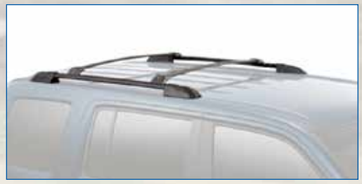
Factory installed roof rack

Your vehicle must have one of the following roof racks to use roof mount cargo carriers.