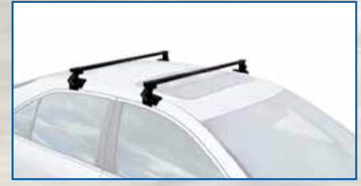
After-market roof rack system