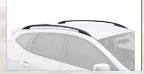
Factory installed side rails