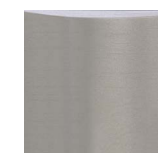
-04 Brushed Nickel Hardware