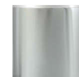
-01 Chrome Hardware