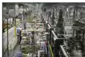
Blow Molding Production

QVTools (Las Vegas, NV) is a financially sound company with strong corporate leadership. With over 100 years in combined Executive experience in Power Equipment & Tools, QV Tools supplies products and services from Dual distribution centers located in Detroit and Las Vegas. QV Tools Designs and Manufactures a number of PowerKing machines & components including the molds that produce our universal blow-molded chainsaw case. Our vertically integrated manufacturing capabilities provide faster response times and superior quality at lower costs. At PowerKing, we have the ability to consistently meet and/or exceed quality and on time demand expectations.