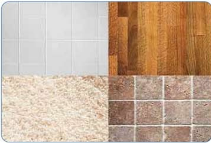
MC-CG955 Multi Surface Canister MC-PN150 Multi Surface Nozzle

Solid and mixed surfaces are the norm for today's new homes and each surface has its own cleaning challenge. The MC-CG955 Multi Surface is the first power nozzle canister designed to be used with the agitator "ON" for superior and gentle cleaning of area rugs, stone, hardwood floors and tile.