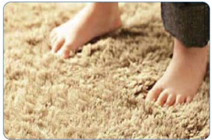
MC-CG957 Plush Pro Canister MC-PN250 Plush Pro Nozzle

Solid and mixed surfaces are the norm for today's new homes and each surface has its own cleaning challenge. The MC-CG955 Multi Surface is the first power nozzle canister designed to be used with the agitator "ON" for superior and gentle cleaning of area rugs, stone, hardwood floors and tile.