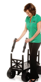
Optional Fishing Pole Holders