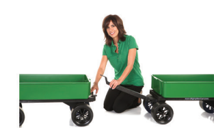
Optional Hitch Assembly