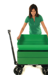
Stack 3 tubs