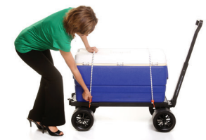
Optional Bungee Cords