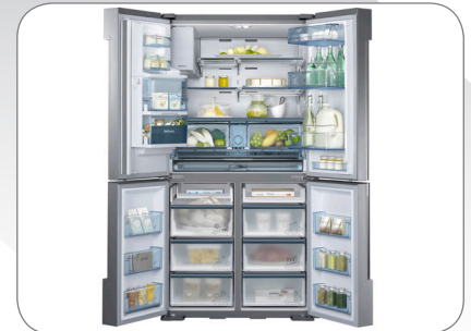
Extra Large Capacity