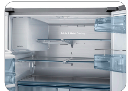
Triple and Metal Cooling System