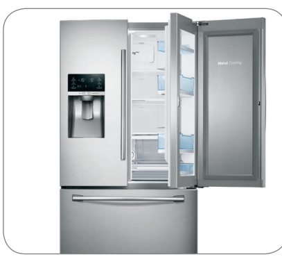
Food ShowCase Fridge Door