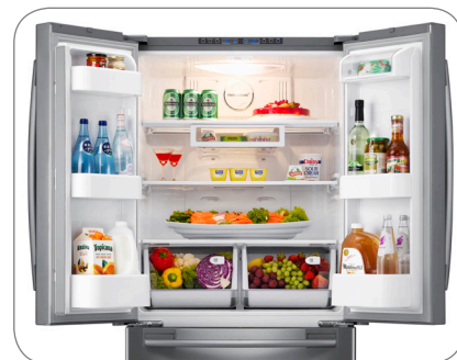
French Door Design