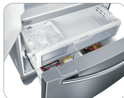
Automatic Filtered Ice Maker in Freezer