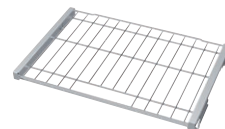
HEZTR301 30" Telescopic Rack