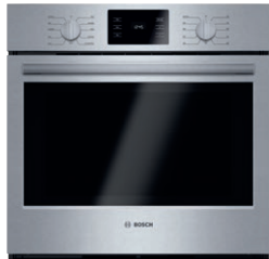
HBL5451UC Stainless Steel

The Bosch wall oven features Genuine European Convection and heavy metal stainless steel knobs .