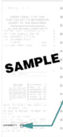
Mattress Warranty Code found here.