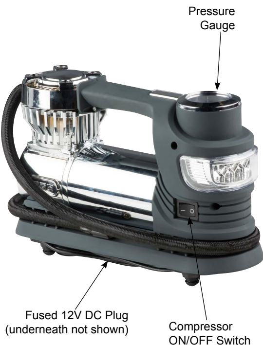
Figures 1 & 2 - W-1804 Nomenclature