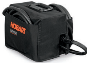
Protective Cover #770771 Weather-resistant nylon resists stains and mildew while protecting the finish of your plasma cutter.