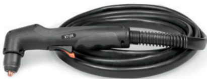
XT12R Replacement Torch #268919 12 ft. (3.7 m)