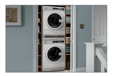
REVERSIBLE DOOR Offers maximum flexibility of any space and easy transfer of clothes from washer to dryer.