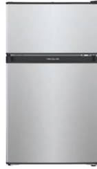
FFPS3133UM Compact Refrigerator