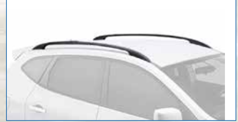
Factory installed side rails