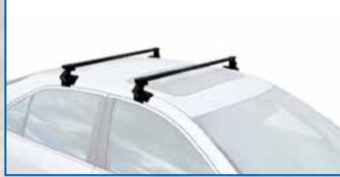
After-market roof rack system