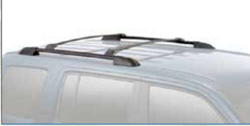
Factory installed roof rack

Your vehicle must have one of the following roof racks to use roof mount cargo carriers.