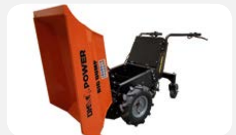
Vertical dump 90 degrees