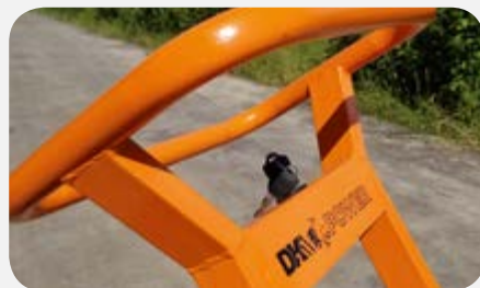
Adjustable Bow Handle With Heavy Duty Frame Mounting