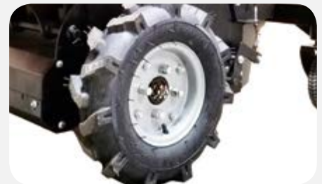
All terrain tires