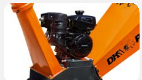
Kohler 14 HP CH440 Engine - 3 Year Warranty