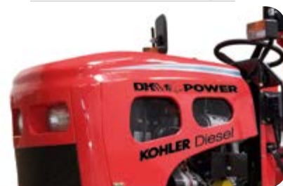
All Metal Hood Construction