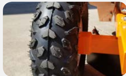
ATV Tires DUAL Locking - Off Road only