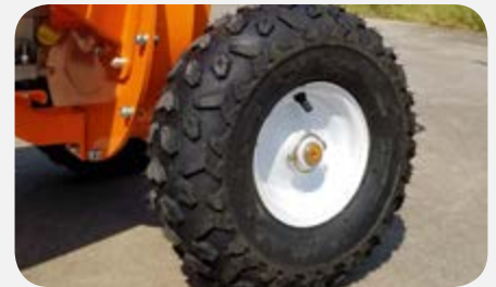
ATV Tires-locking - Off Road only