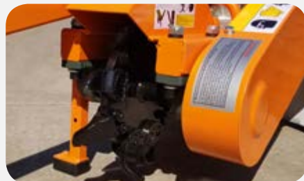
9 Carbide Cutting Head - Direct Drive