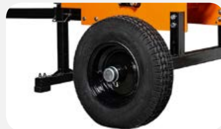
25MPH D.O.T. Tires