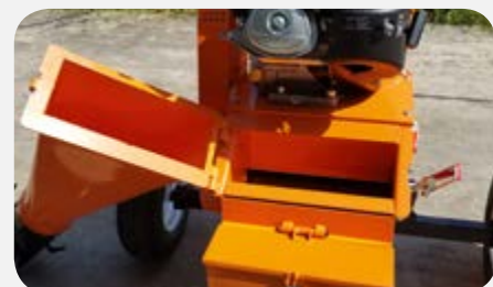
Extended Axle / Dual Swing Chutes / Tool Box