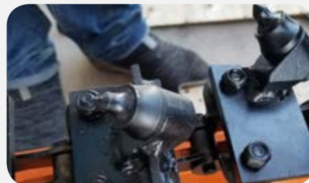
Tri-Cut High Carbide Teeth