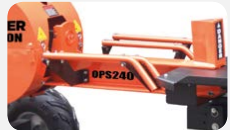
8" Expansive solid steel wedge