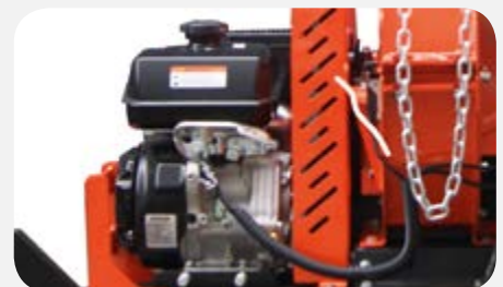
Kohler 14 HP CH440 Engine - 3 Year Warranty