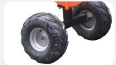
ATV Tires- Locking