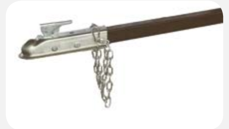
1 7/8 inch removable tow bar.