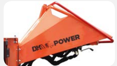
Adjustable feed speed controls.