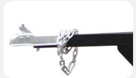
1-7/8 inch removable tow bar.