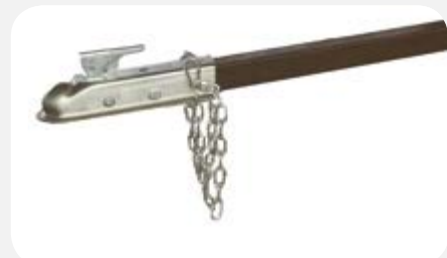
2 inch removable tow bar - D.O.T. Road Legal