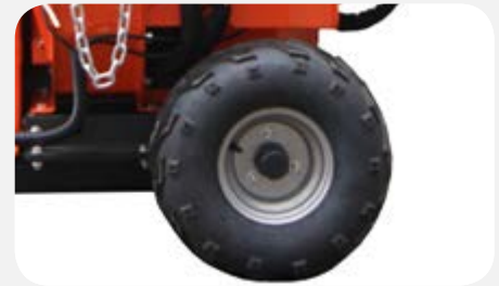
ATV Tires Locking