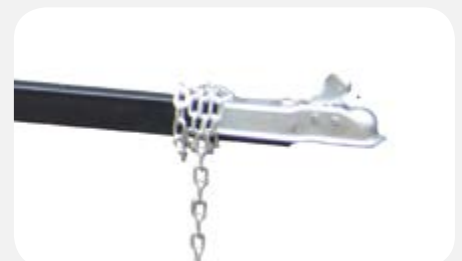
2 inch ball hitch