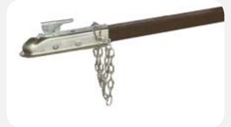
2 inch removable tow bar - D.O.T. Road Legal