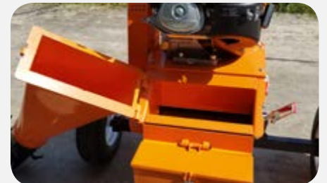
Extended Axle / Dual Swing Chutes / Tool Box