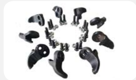
FREE Extra Set Of 9 Carbide Teeth