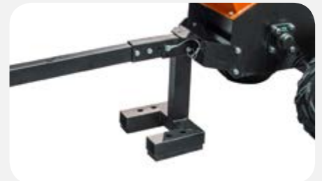
Quick Drop Stand.