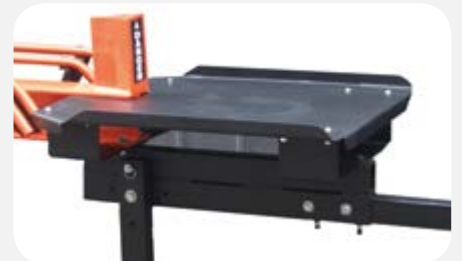
Oversize steel work table