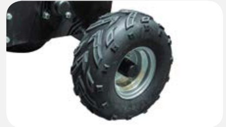
ATV Locking Tires