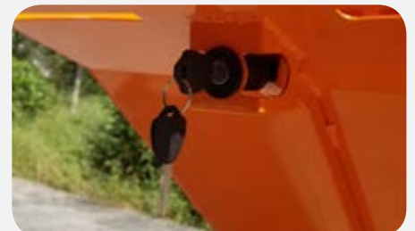
Lock Out Safety Keys