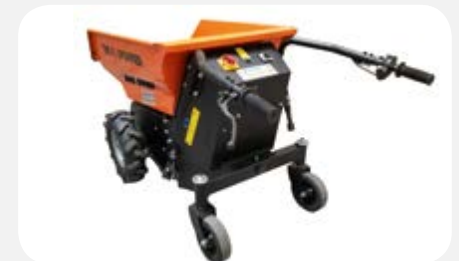
Max speed 6 mph