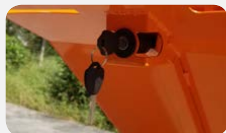
Lock Out Safety Keys