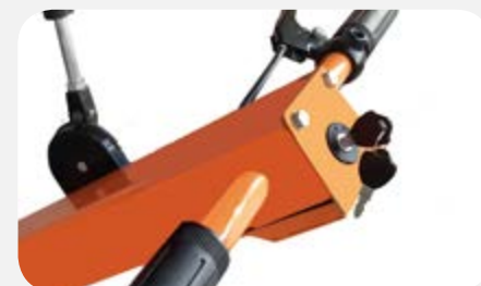
Lock out safety keys - Locking Throttle