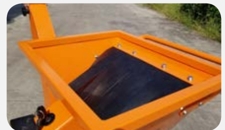
Large Feed Chute