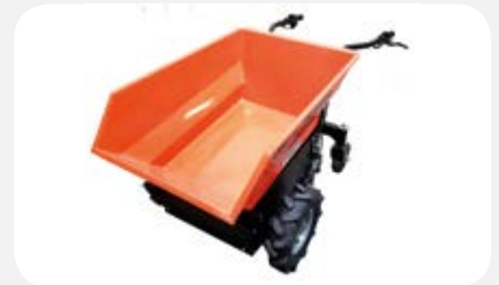
1000lb Max Capacity