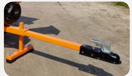
1 7/8" Removable Tow Bar