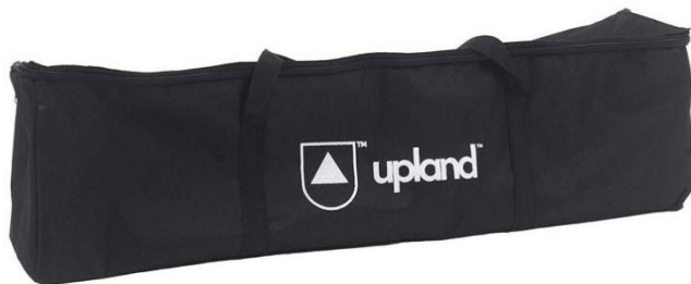
Carrying Bag X 1 pcs