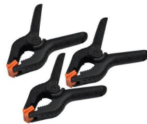
Clamp X 3 pcs