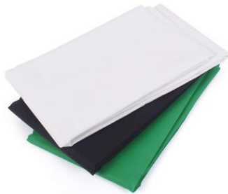
Backdrop X 3 pcs