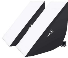
Softbox with Light Holder X 2 pcs