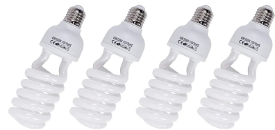
Light Bulb X 4 pcs