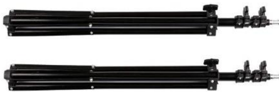
Light Stand X 4 pcs