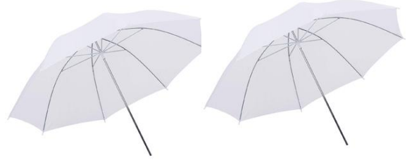
Umbrella X 2 pcs