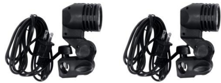
Light Holder X 2 pcs