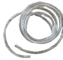
Hose 10 feet