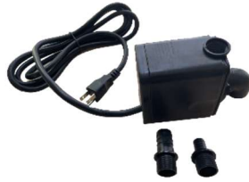
Pump (with 2 adaptors)