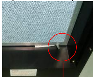
WRONG WAY if lever visible