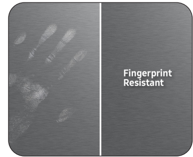
Fingerprint Resistant Finish