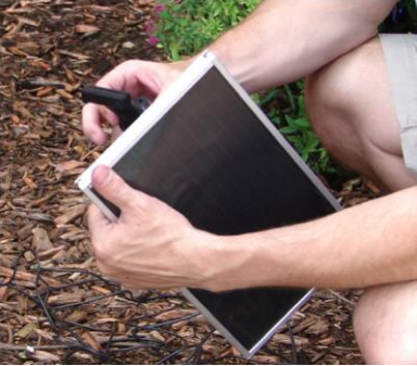
Step 9-Assemble solar panel