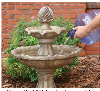
Step 8- Fill both tiers with water.