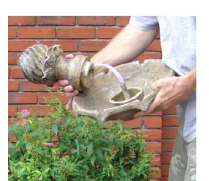
Step 3 - Feed water tube through 2nd tier