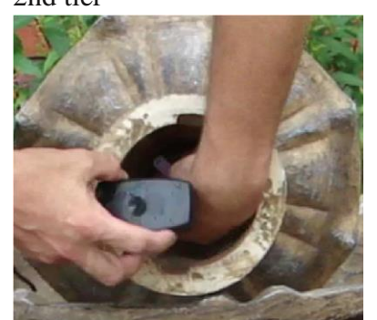
Step 6- Attach water hose to pump