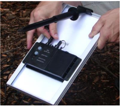
Step 10- Plug cord into solar panel and push "Solar ON/OFF" button (with green light on, pump will run in direct sunlight)