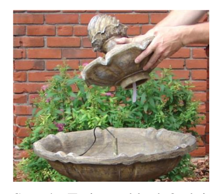
Step 4 - Twist and lock 2nd tier to top piece