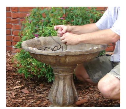
Step 2 - Feed pump cord through hole in large tier.